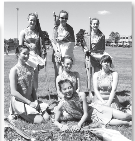
Our 3rd Place: Winning Colorguard at Pageant of Bands.